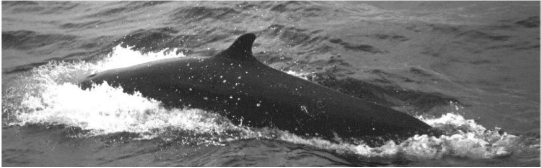
Figure 2. Dorsal fin of a pygmy killer whale ( Feresa attenuata ) in Ecuadorian waters

head or with the lateral sides of the body. This aerial behavior was described as running leaps and hard splashes. Also, the heads of the individual adults and subadults were outside of the water, and they were bowriding in the waves produced by the boat.