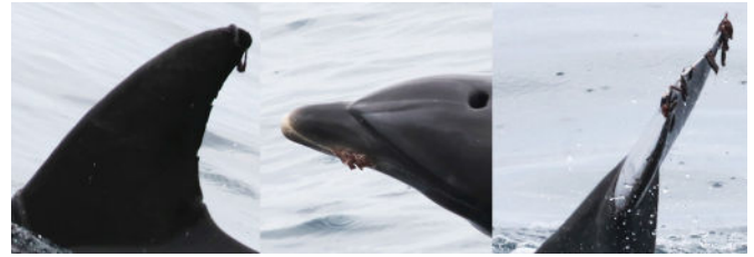
Figure 6. Xenobalanus globicipitis barnacles attached to different body parts of offshore bottlenose dolphins Tursiops truncatus off Ecuador.

The presence of the commensal barnacle Xenobalanus globicipitis was also assessed in the group at Salango Island in March 2021. Not every animal could be assessed to the same extent, but out of 55 dolphins, 26 (42.3%) had barnacles attached to one or more parts of their body: 15 parts of their body, including the upper edge of the dorsal fin, the trailing edge of the tail, the peduncle ( n=1 ) and the left side of the mouth ( n=1 ; Fig. 6). Eight dolphins had barnacles on both the dorsal fins and the tail, and one also had them in the lumbar area. The number of barnacles varied, with the majority on the tail, although a detailed calculation was not possible. Twenty-four animals with barnacles were adults, but two calves also had barnacles attached to their dorsal fins.