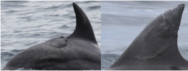
Figure 4. Two offshore bottlenose dolphins Tursiops truncatus with crescent scars presumably caused by shark bites.

Salango group. The remaining scars on the dolphins' bodies were generally rake marks from intraspecific interactions.