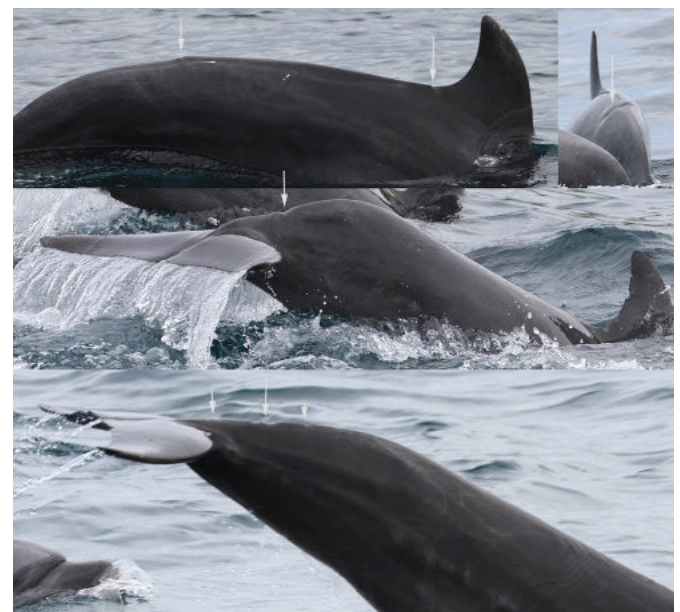
Figure 3. Offshore bottlenose dolphins Tursiops truncatus with scars on the lumbar and caudal areas, likely caused by interaction with fishing nets. White arrows indicate where scars or depressions were presumably made by some type of gear.

Crescent scars probably caused by sharks were seen on two dolphins (3.6%). In the first case, the bite was on the upper back behind the dorsal fin, and in the second on the left side of the dorsal fin (Fig. 4). A 5-cm-in-diameter grayish scar without defined borders, resembling a healing wound or a type of discoloration, was seen on the antero-dorsal part of a young dolphin in the