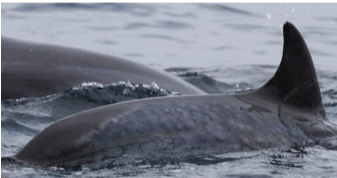
Figure 5. Dermal nodules in an immature offshore Tursiops truncatus bottlenose dolphin around La Plata Island on the central coast of Ecuador.

Semicircular dermal nodules were seen on one immature individual (prevalence: 0.61%, 1/163) close to La Plata Island in August 2022. The nodules extended along both flanks, beginning in front of the dorsal fin and moving toward the lumbar region (Fig. 5). Nodule diameter was estimated at 2–4 cm, and they were mostly rounded with light gray coloration. Some nodules