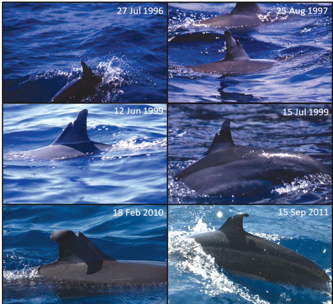
Figure 3. Progression of dorsal fin bending arising from an injury to the leading edge of spinner dolphin #079 in Maui Nui, Hawaii. All photographs were taken by a researcher under NMFS research permit.