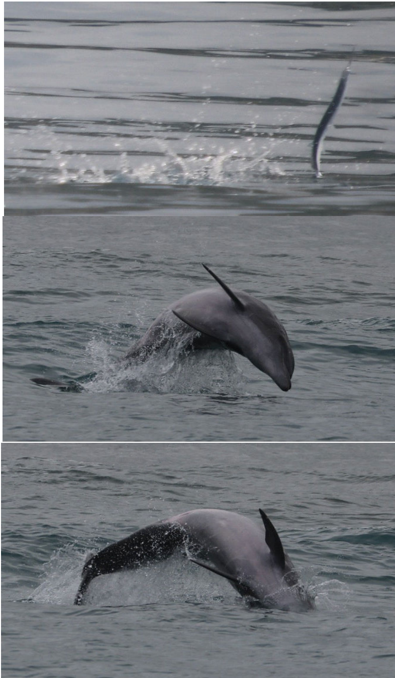
Figure 5. First photo. Photograph of the cornet fish leaping out of the water chased by a dolphin. Second and third photo. Male dolphin leaping close to shore, chasing prey.

Feeding. On February 2 and 4, 2021, we observed two feeding periods in coastal bottlenose dolphins. A solitary dolphin and a group of two. During the first observation it was possible to photograph the prey chased by the dolphin leaping out of the water (Figure 6), a fish known locally as “corneta” Fistularia sp. (Figure 5). During the second case a dolphin chased fish on the waves close to the shore.