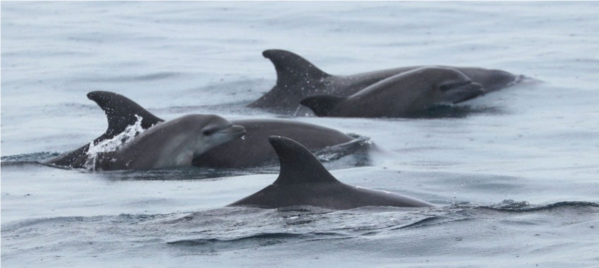
Figure 3. Group of oceanic bottlenose dolphins (mothers with calves) resting around Salango Island. Note more falcate shape of dorsal fin.

Behaviour. Several behaviors were recorded during the sighting periods. Here the most remarkable.