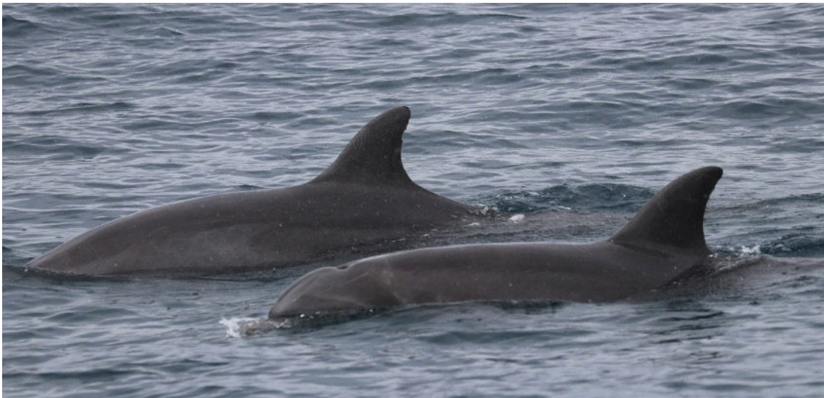
Figure 2. Coastal bottlenose dolphin traveling close to the vessel in Libertador Bolivar. Note the triangular shape of the dorsal fin.

The sex of one of the individuals was determined as male by a photograph of the genital part when breaching. The two were immature animals and exhibited typical inshore behavior, swimming slowly along the shoreline within the first 500 m. An ID number were assigned to both individuals as part of the first dorsal fin identification catalog for Central Ecuador.