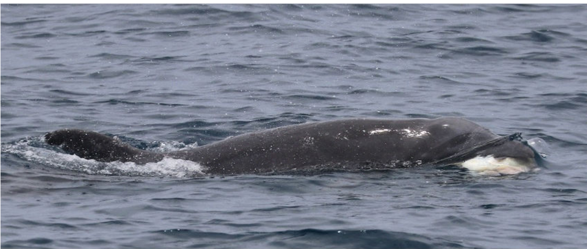
Figure 4. Coastal bottlenose dolphin observed with a small rope over its mouth and a plastic bottle. Possible recreational activity or interaction with fishing gear.

Playful or recreational activities. On 2 February 2021, while observed a group of two coastal bottlenose dolphins, one of them kept away from the boat. Its mouth was always open apparently grabbing something like a plastic object (possibly a plastic bottle) with something whitish (maybe animal tissue or a type of clothing) and a rope. It could be a recreative activity with a bottle used by fishers as a buoy or to mark where fishing nets are set. This dolphin was observed again two days later off Simon Bolivar, without the plastic bottle and rope (Figure 4).