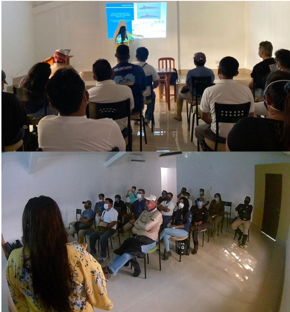
Figure 7. Training on cetacean identification at Puerto López on 4 February 2021.